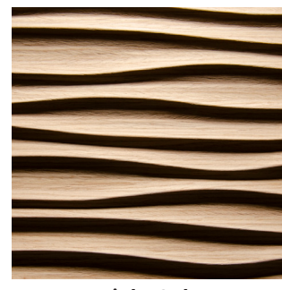
Light Oak Alpi veneer