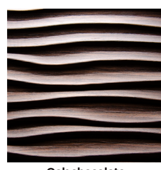
Oak chocolate Alpi veneer