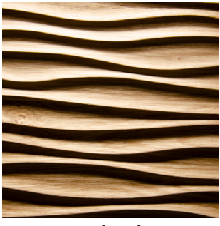
Real wood veneer